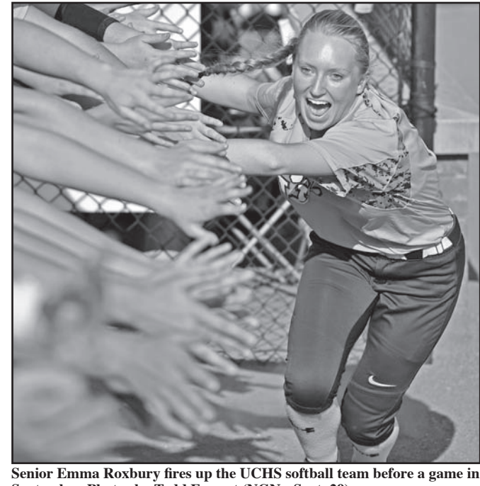
September. only qualified one individual, of play, along with the game's

The baseball team returned to State following a thirdplace finish in Region 8-AA and the track and field program fielded multiple region champions. The golf program featured a young squad and picked up some regular-season wins but